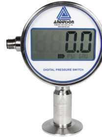
EP Life Sciences Series Digital Pressure Gauge/Switch