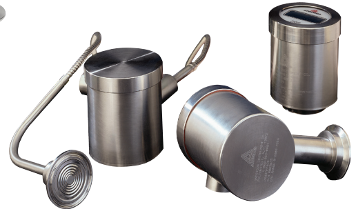
TP HART/SMART Life Sciences Series Pressure Transmitter