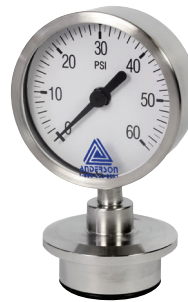
EK Life Sciences Series Pressure Gauge (63mm)