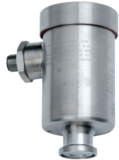
HA Life Sciences Series Mini Pressure Transmitter