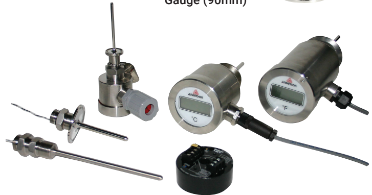
SW/CT RTD and Temperature Transmitter