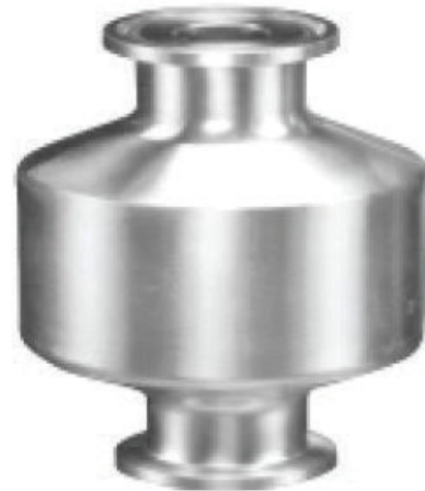
Figure 1. DS100 Series Thermostatic Steam Trap

Installation, operation and maintenance procedures performed by unqualified personnel may result in improper adjustment and unsafe operation. Either condition may result in equipment damage or personal injury. Only a qualified person shall install or service the DS100 Series steam trap.