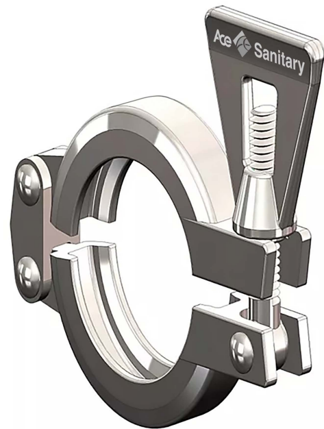
Shown with Standard Wing Nut