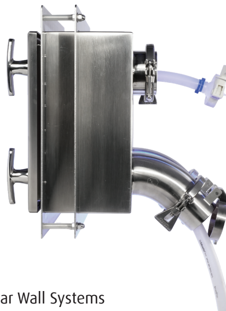
Designed for Installation Between Modular Wall Systems