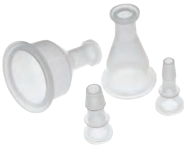
Sanitary Fittings Barbed Adapters, Reducers, TC's