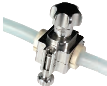
Tubing Pinch Valves 3 Body Sizes, Stainless Steel Body