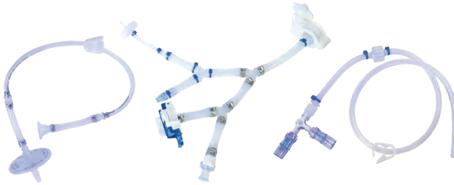
Tube Set Assemblies Customized, Preassembled Silicone and TPE Tubing