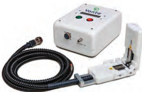
Tube Sealer/Welder Sealers: 0.125" - 0.375" OD Welder: 0.375" - 0.75" OD