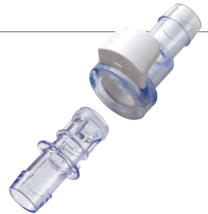
Bioprocess Fittings Quick Connects, Aseptic Connectors, Luer Locks