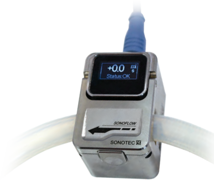
Ultrasonic Flow Meter Highly Accurate, Non-invasive Clamp-on Flow Sensor