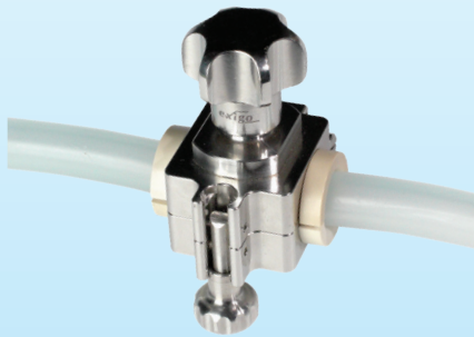
Tubing Pinch Valves