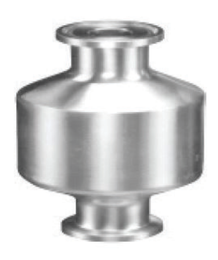
Figure 1. DS100 Series Thermostatic Steam Trap

A steam trap is an automatic valve which discharges condensate, undesirable air and non-condensibles from a system while trapping, or holding in, steam.