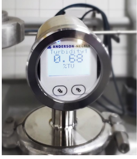
Phase separation, filter and separator monitoring