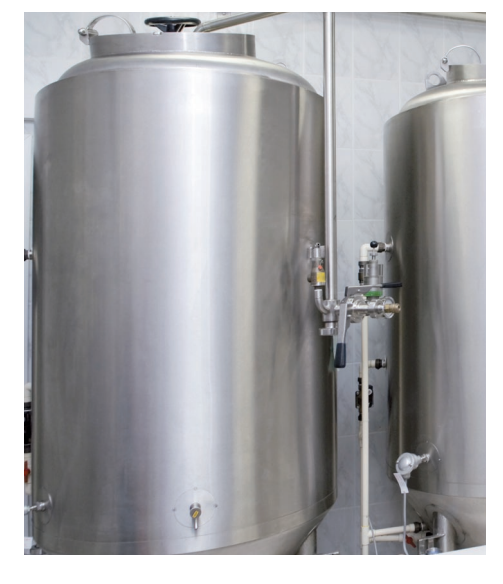
Pressure measurement in small pipe diameters and vessels