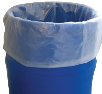
Tank Liners 50L to 1,500L Open or Closed Top, 3-Ply