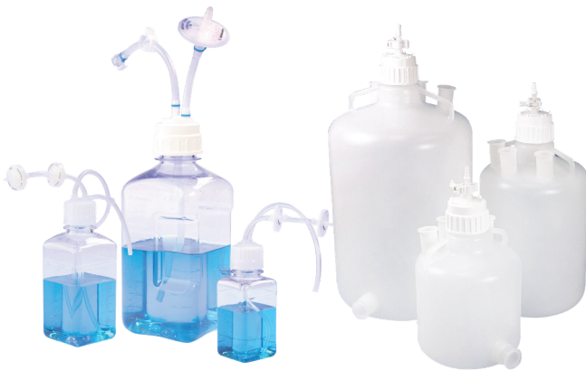
Bottles & Carboys From 60ml to 40L