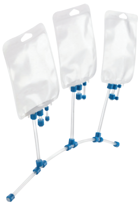
Bag Manifolds Custom Sizes, Lengths and Configurations