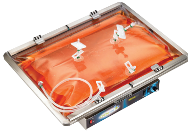
Motion Bioreactor Bags 5L to 50L, 4, 5 and 7 Ports, Single, 2 and 3-Ply