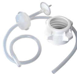
Bottle Cap Assemblies