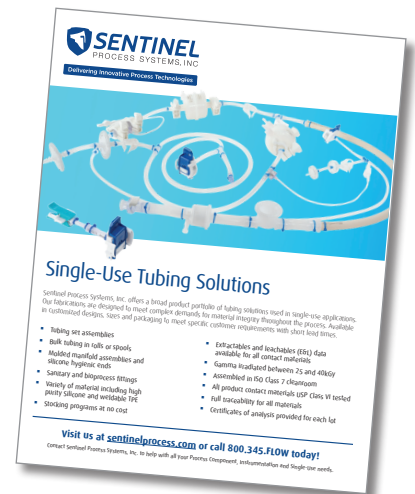
Also Check Out Our Tubing Solutions Flyer