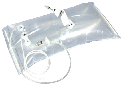
2D & 3D Bioprocess Bags 50ml - 2,500L 1 - 5 Ports, Single, 2 and 3-Ply